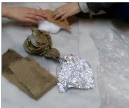
Figure 4. Children select materials and objects to cocoon the ice-cube

The findings revealed that the children were able, to some extent, to approach the insulating or non-insulating property of the materials. This is evident from the fact that most of the children (4/6) selected aluminium foil as the most suitable for maintaining the “frozen snowball”. Respectively, most of the children (5/6) considered the fabric inappropriate as a material for the preservation of the “frozen snowball”. Each child developed their reasoning to justify his/her choice, whether it was about snowball management or the choice of material or object. Paper was not selected as an appropriate material from most of the children (5/6). Regarding the choice of paper as a suitable material, only one child chose it without giving a justification.